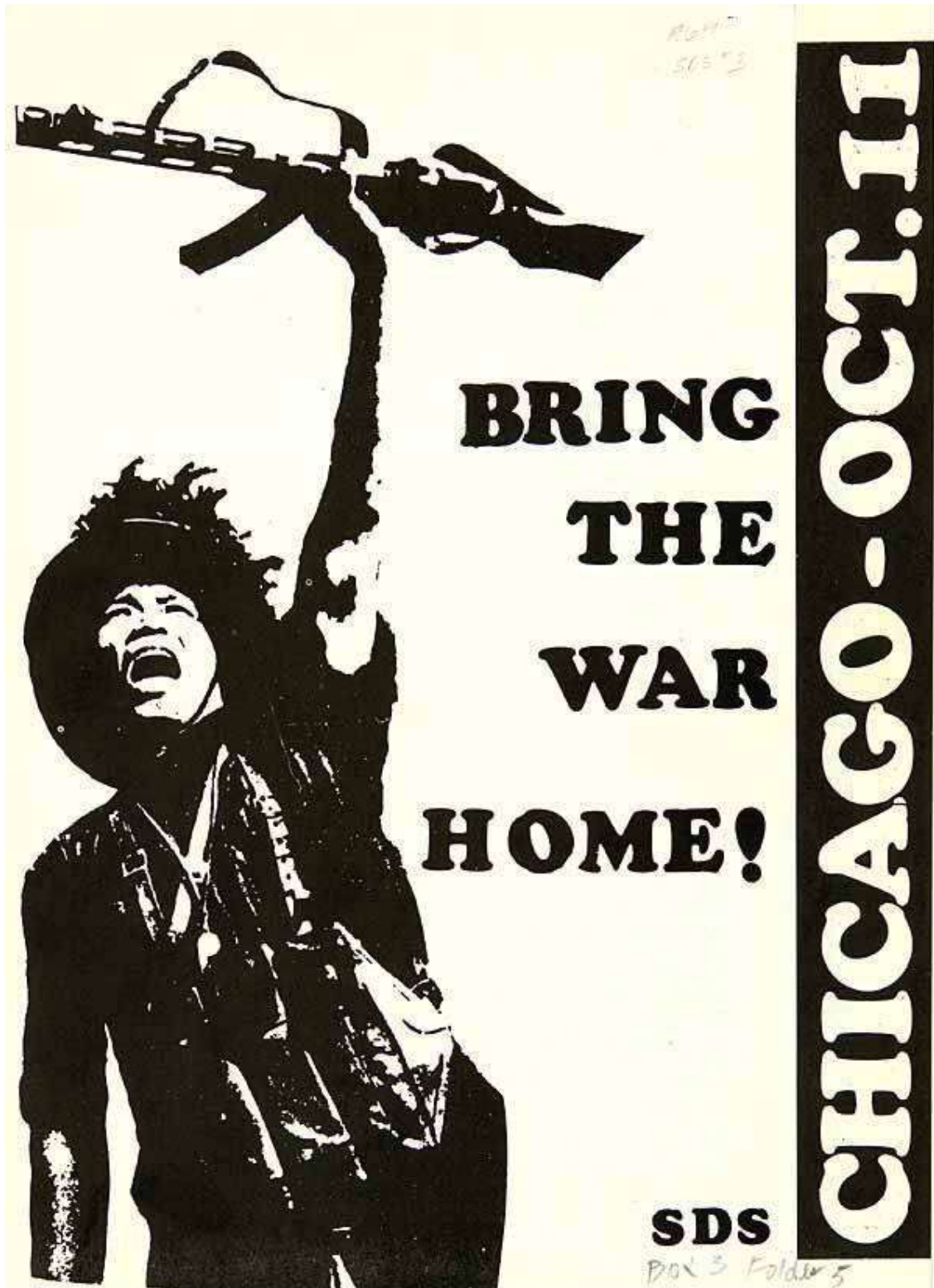
Property of Special Collections, Univ. of Washington Libraries, Vietnam War Era Ephemera Coll.